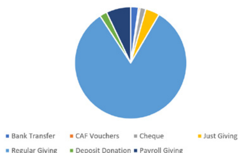
How our donors give to King's